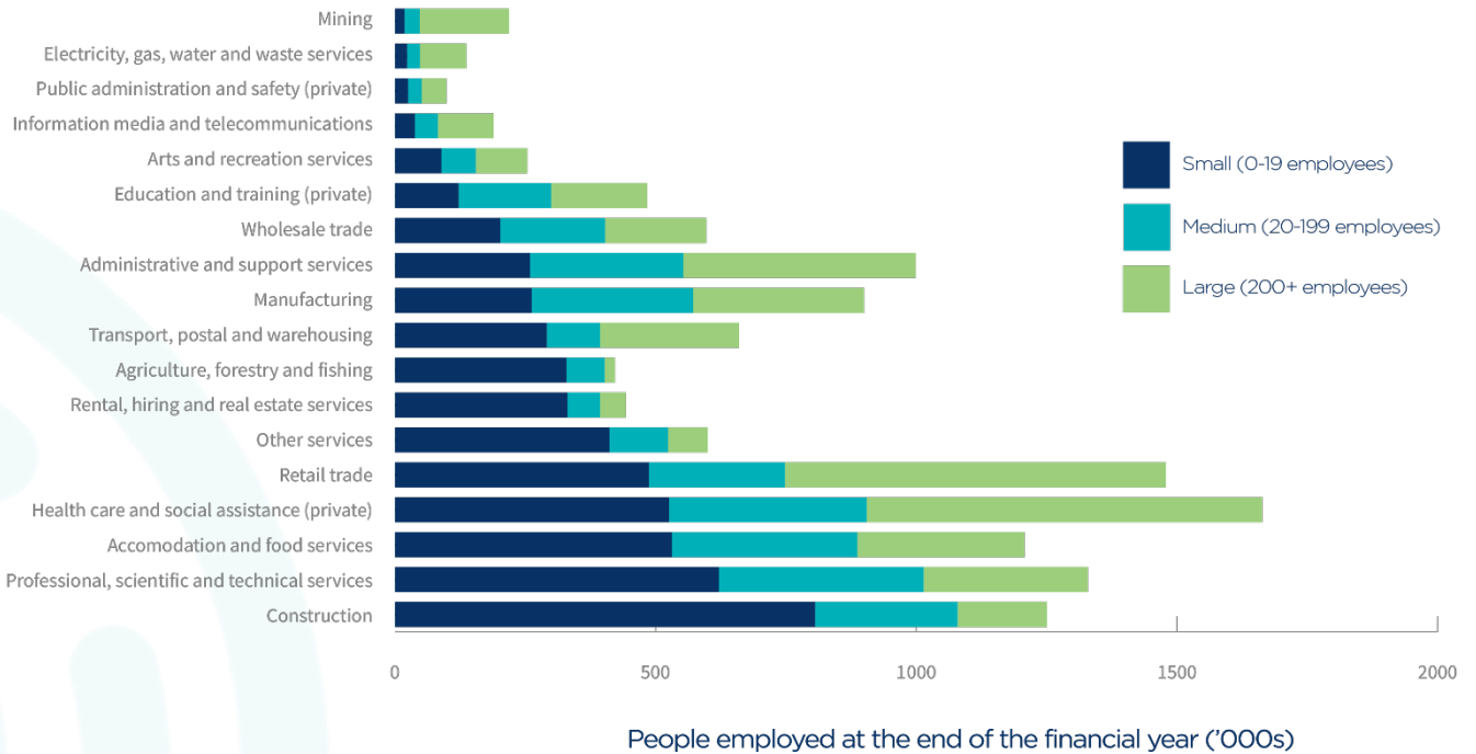
Chart 2: Total employment by industry ranked by number of people employed by small business, 30 June 2023

The ABS publish this data for selected industries, which excludes financial and insurance services.